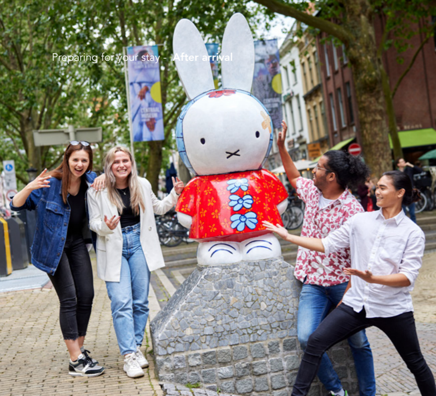
Preparing for your stay - After arrival